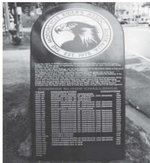
The MRA Blood Challenge trophy. Let's see if we can wrest it from the competitors this year!