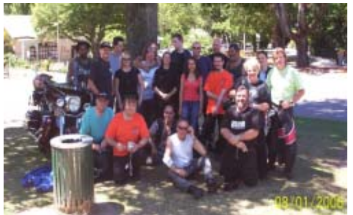
Look at who you can meet up with when you go on an MRA social ride. This was taken at Marysville in January.

Any MRA member who would like to lead a ride or has an interesting ride. contact Ride Coordinator on 0413 995 424