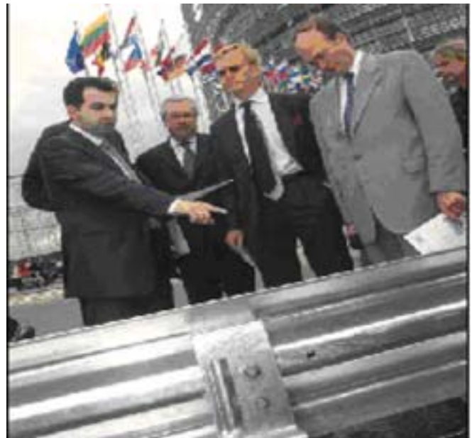
Euro parliamentarians examining a much friendlier to motorcyclists barrier that could be adopted rather than WRBs.

The ban on cable barriers fits, according to the MAG, very well in the increasing awareness of the controllers of public roads that the infrastructure should also be suited for and safe to the drivers of motorised 2-wheelers. On October 26 th 2005, secretary of State Karla Peijs has committed herself to make, in cooperation with MAG, an inventory of the locations on the Dutch national highways where making the guard rails “motorcycle-friendly” should be started. Guard rails can simply be adapted to the safety requirements for motorcyclists by mounting an extra board below the rail and the MAG has started negotiations with the Ministry of Traffic and Water Management.