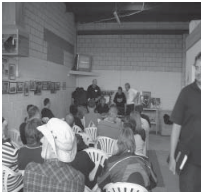
MRA HQ at Quist Crt, where you can drop in for a cuppa and pizza and watch Ch. 31's Two Wheel Torque bike TV show.

Riders meet for coffee at around 6pm at the Bear Brass Cafe, Southbank and usually finishes up around 9pm. It's not an MRA specific event. All riders are welcome.