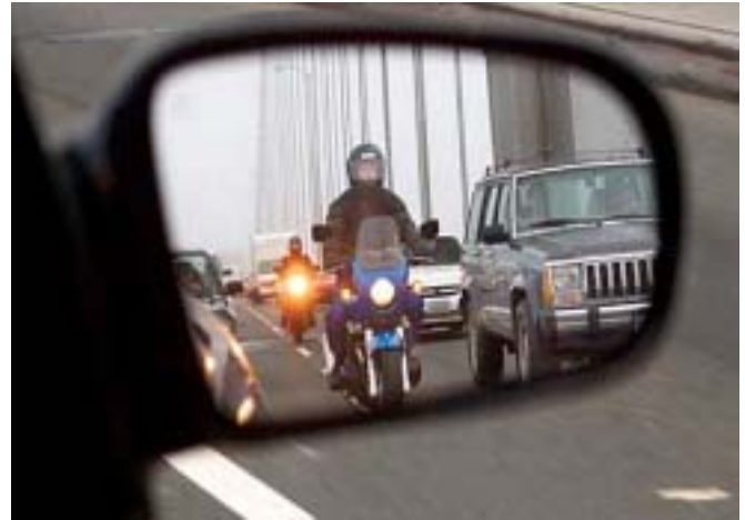
Motorcyclists demonstrating the benefits of commuting by motorcycle in heavy traffic.

Providing improved mobility for motorcycles in traffic contributes to a decrease in congestion. This mobility may be improved by numerous methods;